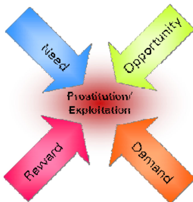
Figure 3. Motivating Factors 9

2.4.2 Need might include the perception that there are no other options available to obtain/maintain a lifestyle – ranging from a basic hand-to-mouth “survival strategy” existence, to creation of wealth.